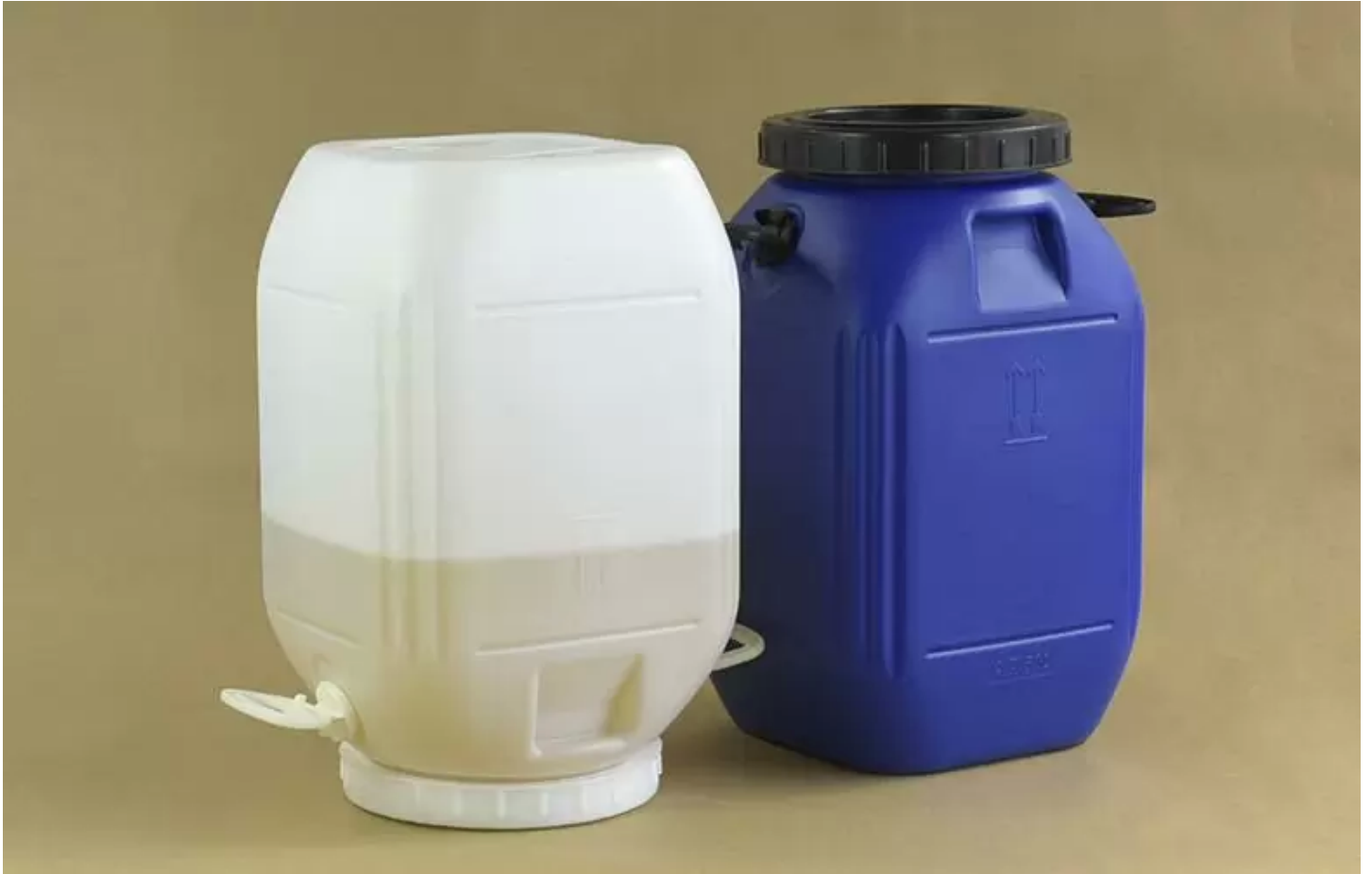
Upside-down placement with no leak: Equipped with anti-theft cover and inner cover, firm sealing, good leak-proof and anti-theft performance, safe and convenient to use